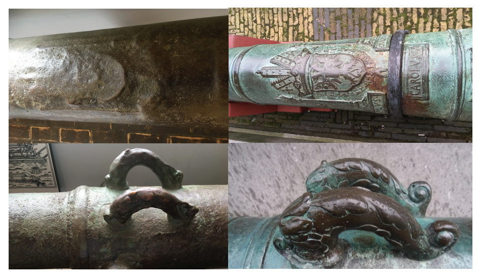
Coats of arms on the Dunwich cannon (top left) and the Rode Paard cannon in Enkhuizen (top right), dolphin handles on the Dunwich cannon (bottom left) and Rode Paard (bottom right).

The Dunwich Bank Cannon's sibling, as a result of not having been underwater for 400 years, is also in much better condition. Some of the details lost on the Dunwich cannon can still be seen on the one in Enkhuizen.