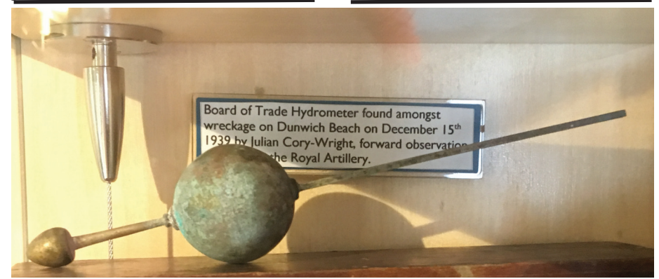
The Museum's hydrometer, acquired last year, now on display resting on its box.

Taking a reading from the scale, you looked in your Sykes Tables , which is a thin book full of algorithms, from which you worked out the density (the proof).