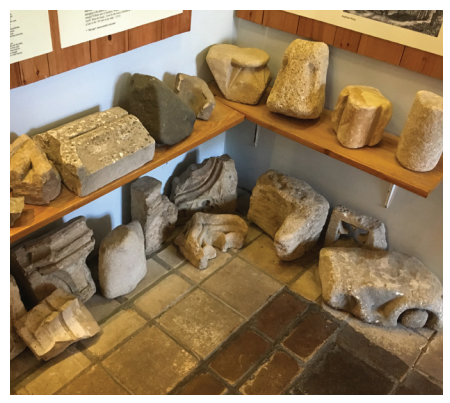
Fragments of Dunwich's lost churches, some hauled up during the Dunwich Dives, are on display in Dunwich Museum.

The Twitter account @DiscoverDun-wich has been acting as a virtual Museum, during lockdown, showcasing online the treasures of the Museum collection and providing updates. The offi-