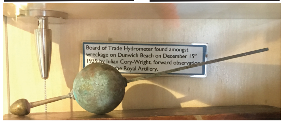
The Museum's hydrometer, acquired last year, now on display resting on its box.

Taking a reading from the scale, you looked in your Sykes Tables , which is a thin book full of algorithms, from which you worked out the density (the proof).