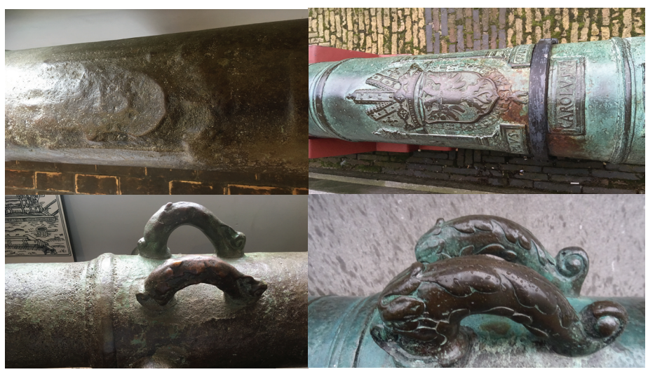
Coats of arms on the Dunwich cannon (top left) and the Rode Paard cannon in Enkhuizen (top right), dolphin handles on the Dunwich cannon (bottom left) and Rode Paard (bottom right).

The Dunwich Bank Cannon's sibling, as a result of not having been underwater for 400 years, is also in much better condition. Some of the details lost on the Dunwich cannon can still be seen on the one in Enkhuizen.