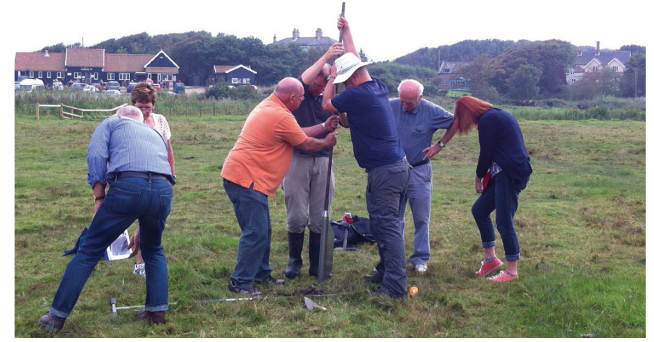
Dunwich Dig volunteers drive a core into the soil in 2015.

Traditionally, hemp crop was left in ponds and wet ditches for some weeks or months adjacent to places of cultivation to separate the fibres. This was clearly the case at this site. This would have been especially important for rope production in Dunwich and most probably for maritime use. Seeds of hemp were also found and radiocarbon dated Thus, it is clear that fields adjacent to this sample site were used for cultivation in 1025