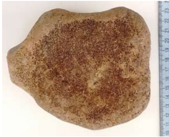
The whale vertebra (DUWHM: N182)

Our Dunwich specimen (catalogue number N182) is a lumbar or caudal (tail) vertebra, most likely from a small baleen (mysticete, filter feeders, like a blue whale or right whale) or medium-to-large toothed whale (odontocete, like a sperm whale). It is not possible to be more precise. Its colour and state of preservation suggest it may have originated in the Red Crag, but was then perhaps eroded out and incorporated into the later Norwich Crag strata that outcrop at Dunwich, dated about two million years ago. It is in a similar state to the Crag whale vertebra (N157) in the display case near the back door of the Museum. There is also a fragment of whale rib, or-