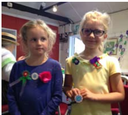
Visitors show off the badges and rosettes they made in Suffragette colours during a “Votes for Women” craft activities day.

– check on the website www.dunwich-museum.org.uk and on Twitter at @DunwichMuseum for updates.