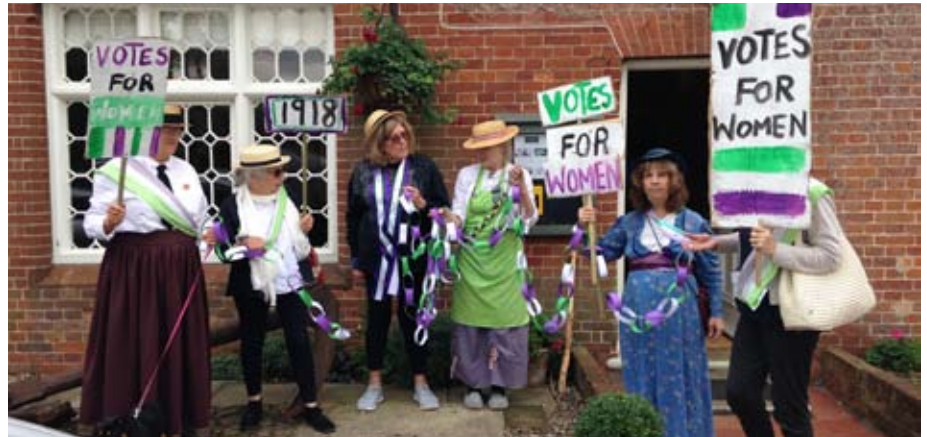
Dunwich Museum celebrates 100 years of votes for women – see back page.

MUSEUM OPENING: Reopening for 2019 – February half term: 16 February 2019-24 February 2019, 2pm-4pm. Open March weekends 2pm-4pm. Then open daily 11.30-4.30 from 1st April 2019 onwards.